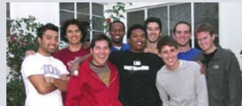
Members of LMU's M.A.G.I.S. (Men Acting Genuinely in Service) after completing a painting project at Languille Emergency Shelter.