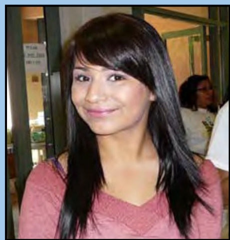
Angel Guardian Resident after her makeover

As the sun rose over Good Shepherd Center on May 4, Big Sunday volunteers had already arrived. Volunteer hairstylists and makeup artists gave each one of our residents a complimentary, professional makeover. Women were then led into the Center's Historic Home, where racks of donated clothing and volunteer wardrobe stylists were lined up to pull together outfits, complete with shoes and accessories, which played up our residents' best features.