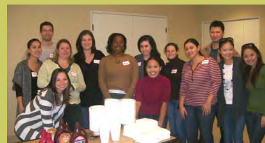
YPG members hosting the ice cream social and Bingo

Membership dues are waived through December 2010, so this is a great time to get involved, all in support of this wonderful organization!