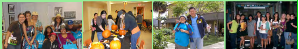
From top left: LA County Fair, Pumpkin carving at GSC, Easter Party at GSC, & a musical at the Pantages Theater