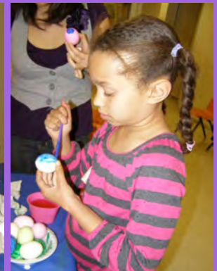
Easter egg coloring and Easter egg hunt with Angel Guardian residents and Young Professionals Group