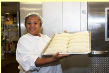
Order your sandwich on a fresh baguette made daily by our trainees!

The Village Kitchen offers hands-on job training and work experience in the culinary arts for up to six women at a time, with three-month sessions during the year.