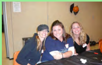
YPG activities with Angel Guardian Families.