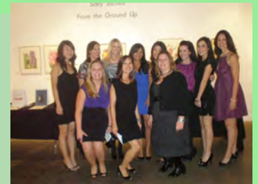
YPG Executive Committee

* Coming soon: our new and improved website www.ypgla.org !